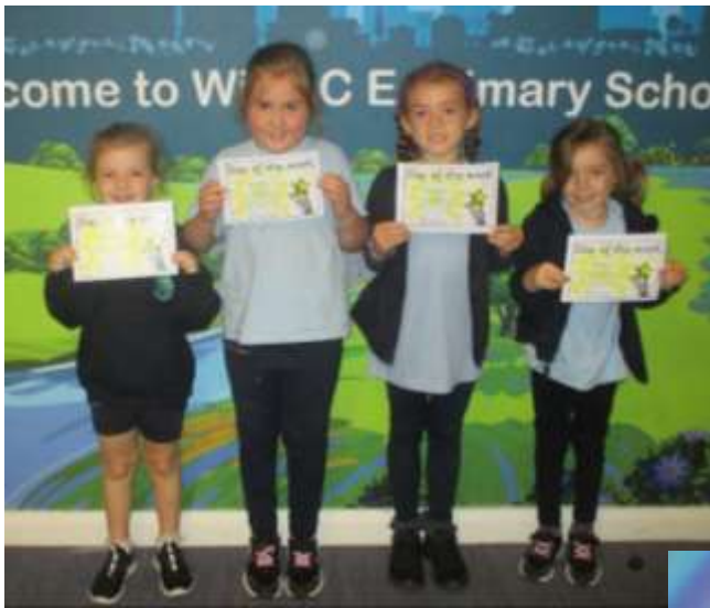
Children proudly showing their certificates this week.