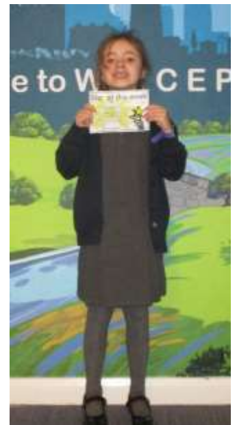
Children proudly showing their certificates