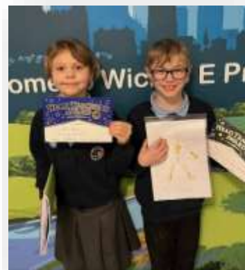
Children proudly showing their certificates!