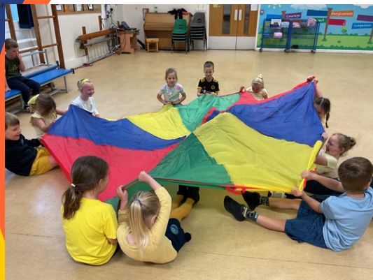
Deer class playing connection games today!