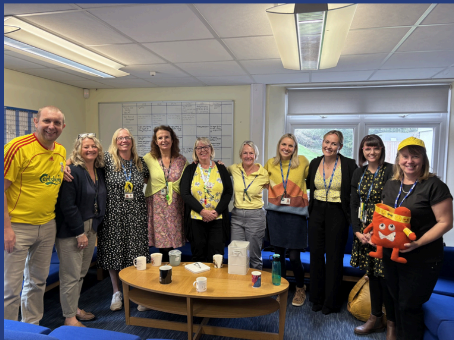
Some of our wonderful team supporting World Mental Health day at Wick!