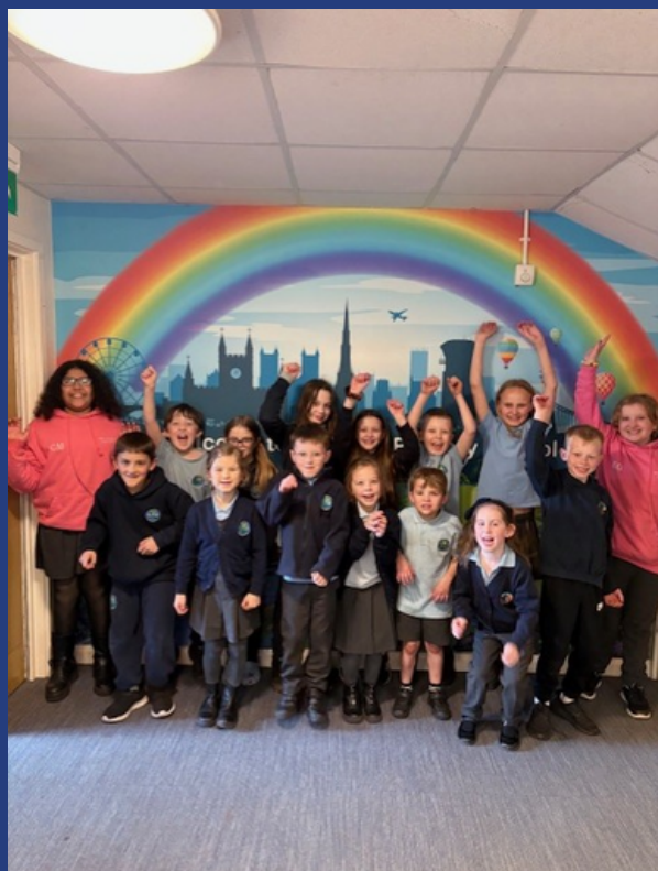
Well done to all our Wick Champions this term!