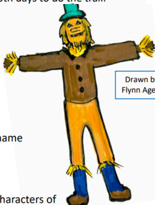
Drawn by Flynn Age 9