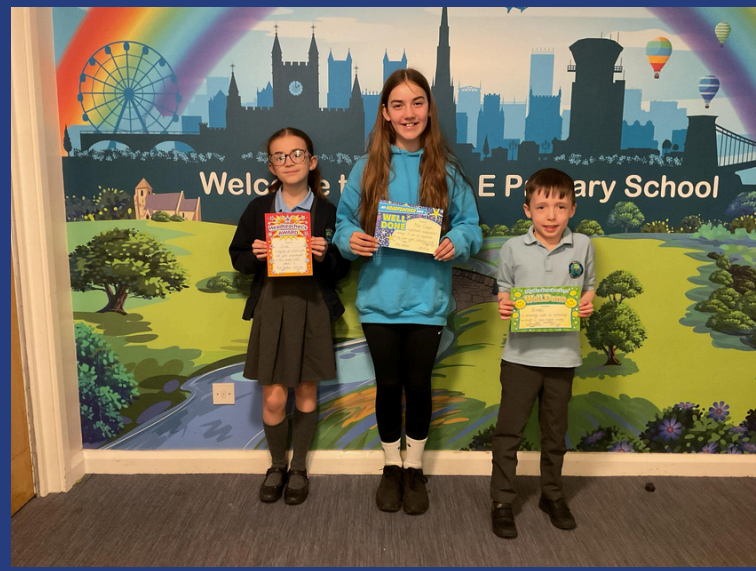
Well done to all the children receiving certificates in Celebration Assembly!