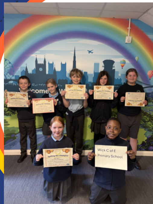
Spelling Bee Champions!